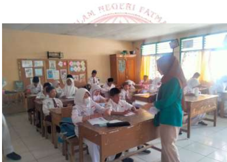
Picture 2. Researcher gave pre-test in control class