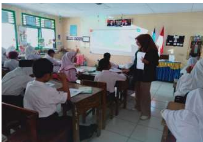
Picture 9. Researcher gave post-test to the experimental class