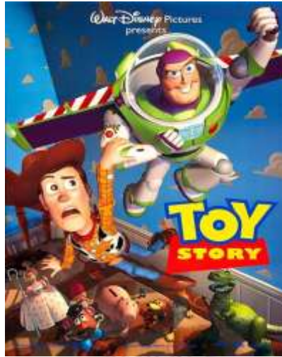
Toy Story 1