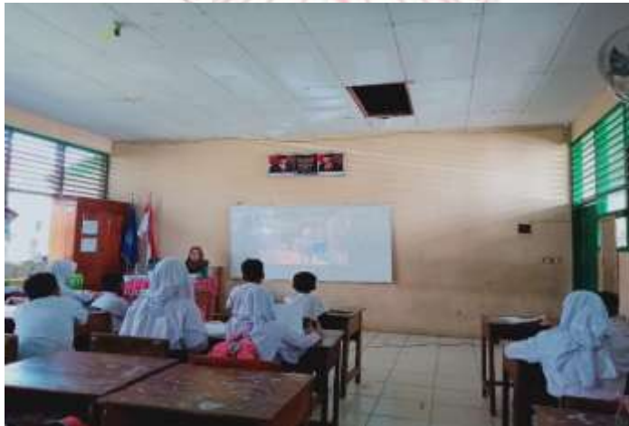
Picture 4. Researcher gave treatment in experimental class