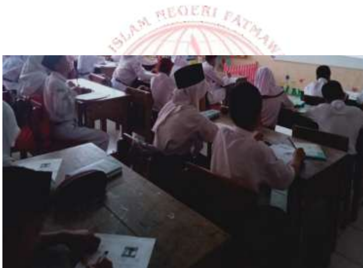
Picture 10. Control class students do the post-test