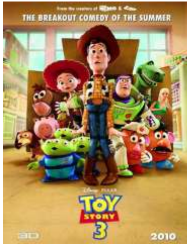
Toy Story 3