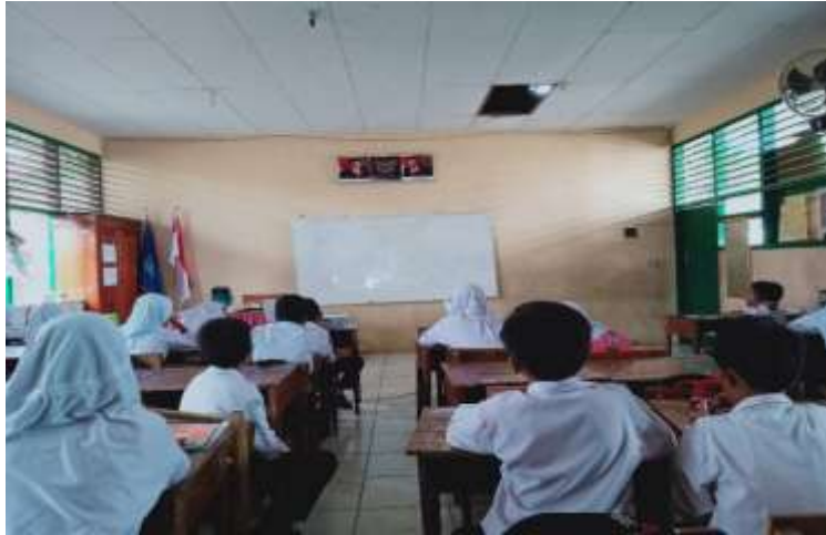
Picture 5. Experimental class students watching toy story cartoons