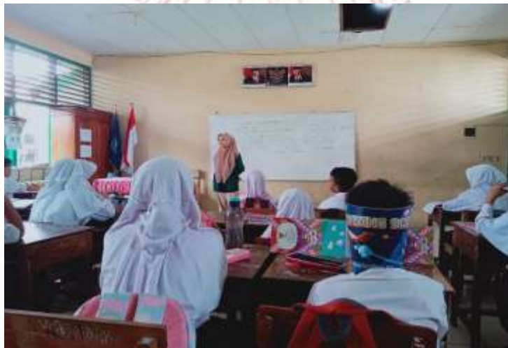
Picture 6. Researcher gave material in control class using conventional technique