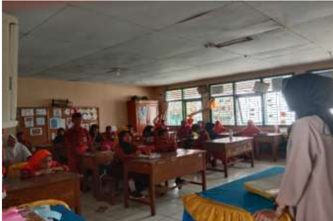
Picture 3. Researcher gave treatment material to the experimental class