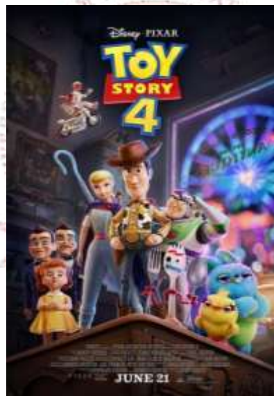
Toy Story 4