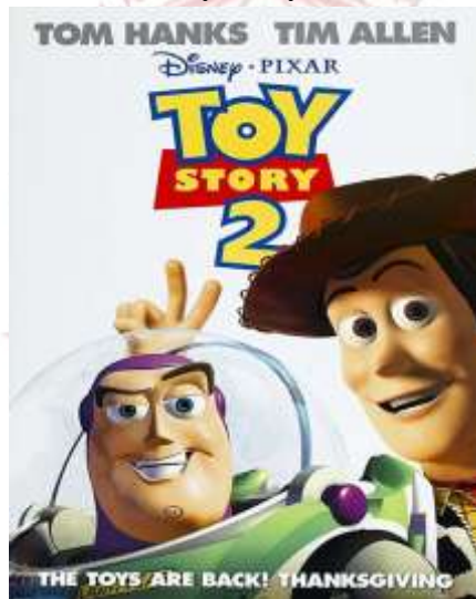
Toy Story 2