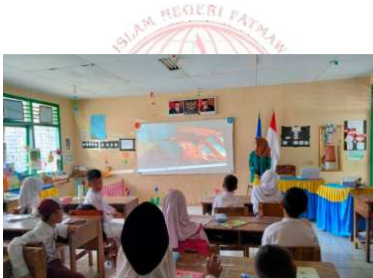
Picture 8. Researcher gave treatment in experimental class